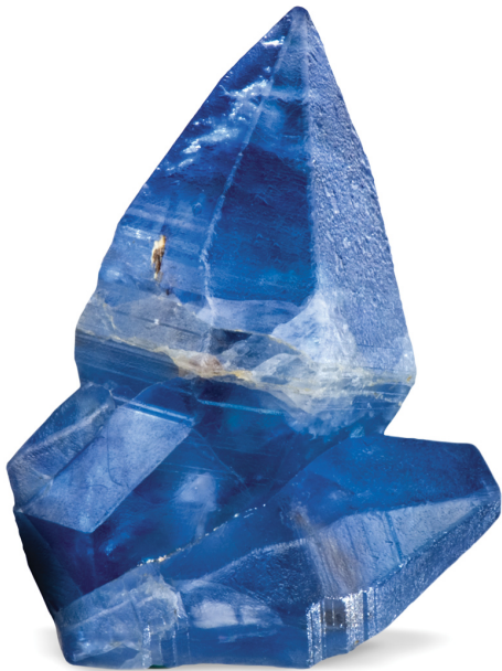
Sapphire rough

JavaScript and Adobe Reader are available as free Internet downloads.