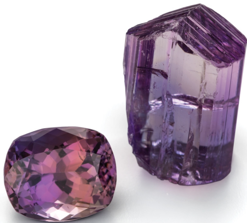
Tanzanite crystal and polished gem.

JavaScript and Adobe Reader are available as free Internet downloads.