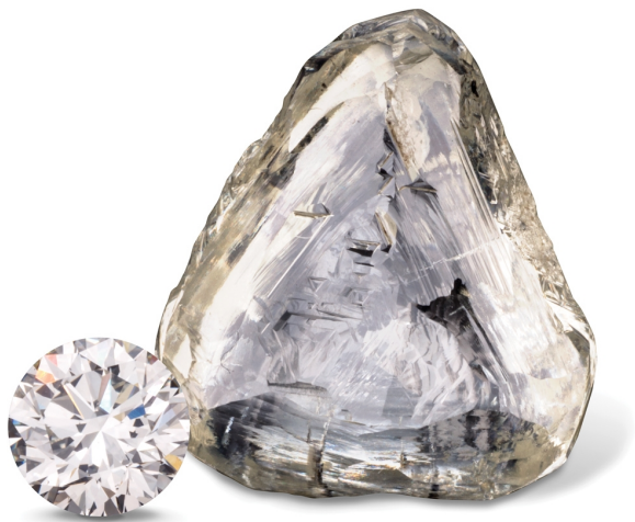
Rough and polished diamonds.

JavaScript and Adobe Reader are available as free Internet downloads.