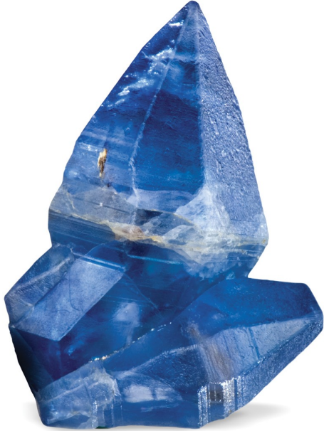
Sapphire rough

JavaScript and Adobe Reader are available as free Internet downloads.