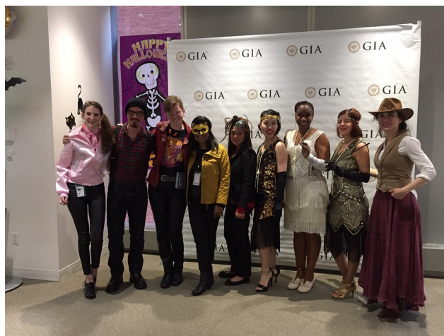
Top - GIA's New York campus is located in the International Gem Tower (IGT)/ Bottom - Students celebrate Halloween