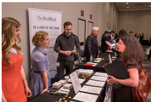
Annual Career Fairs provide students with the opportunity to meet with employers hiring for open positions.