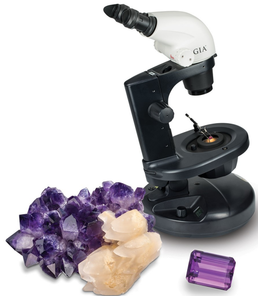
GIA DLScope Professional with rough and polished amethyst