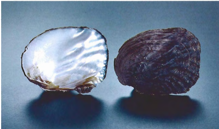
Figure 5. The Unio , or pearly mussel, in which natural freshwater pearls form. The species illustrated here, Megaloniaias gigantea (the "washboard"), may grow to more than a foot; this shell measures approximately 5 in. (13 cm).

flesh of the mussel. The mussel is usually able to seal off and kill the intruder, and then gradually envelop the body in nacre, forming a pearl. Or a small fish can attack the mussel when it is opened to feed, tearing off bits of the mantle. A stray crumb of mantle tissue lodges in the shell, and a pearl begins to grow around it.