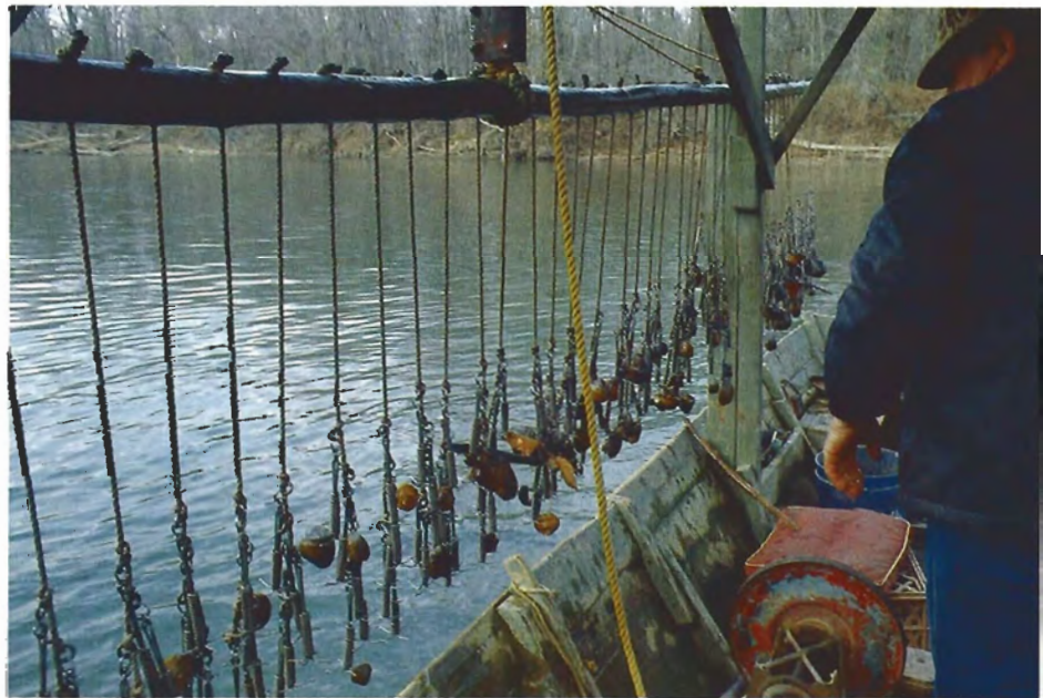
Figure 3. A modern-day brail, with a few captured freshwater pearly mussels.

Yet some of the areas where mussels are still found are economically depressed and the opportunity to earn some money can be a very strong incentive. Many who try diving have little or no training; some do not even know how to swim! Some earn a good living fishing the mussels, but most simply get by or supplement other earnings. The risks are too great, the work is too hard for most. Those who succeed earn every penny.