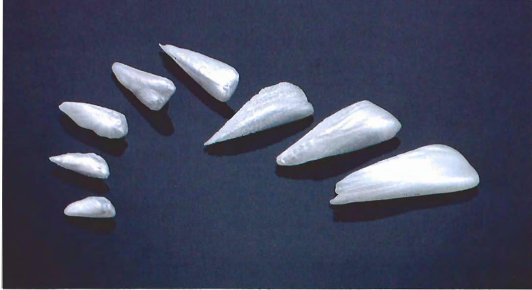
Figure 9. Size and age progression of natural "wing" pearls. Left to right; 6-7 x 2-3 mm, two to three years; 8-9 x 2-3 mm, three to four years; 10-11 x 3-4 mm, four to five years; 12-13 x 4-5 mm, five to seven years; 14-15 x 4-5 mm, six to seven years; 16-17 x 5-6 mm, seven to eight years. Ages are authors' best estimates.

crossing. A finely grooved surface can give the pearl a silky luster and, if the nacre is clear and translucent, can create light interference and dispersion, that is, orient. Because of these and other surface features, because of their baroque and irregular shapes, and because the nacre is often very pure and clear, American freshwater natural pearls show a lot of orient, often significantly more than pearls from other localities.