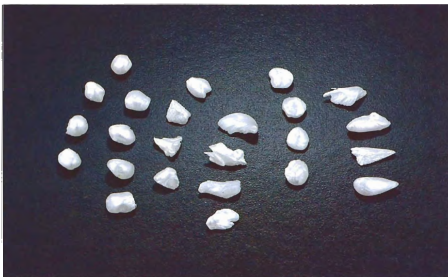
Figure 7. Typical small baroque American natural freshwater pearls, of average to better quality, grouped in traditional shape categories. Left to right: shape no. 2, semi-round, sometimes referred to as "nuggets"; shape no. 3, oval but thick; shape no. 4, roughly triangular, known as "petals"; shape no. 5, longish but flat; shape no. 6, roundish or oval, but flat; and one size of "wing" pearls.

Another special shape is the "rosebud." This characteristically American freshwater pearl is typically high domed, with a flat back and roughly