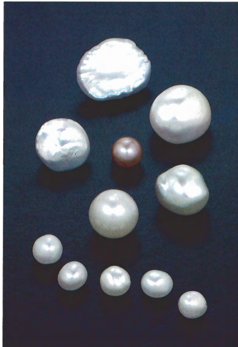
Figure 10. A sampling of freshwater pearls cultured in America by John Latendresse. The group includes one baroque, white rosé, 12 × 10 mm (2.2 ct); one baroque, white rosé, 9 × 8 mm (1.5 ct); one smooth baroque, white rosé, 10 × 9 mm (4.9 ct); one smooth baroque, white rosé, 8 × 7.5 mm (2.7 ct); one round, white, 7 mm (2.8 ct); one round, bronze-lavender, 5 mm (0.79 ct); and five semi-round pearls, white rosé, about 4 mm each (2.65 ct total weight). None of these pearls was treated or enhanced in any way.

And, while many people understand the difference in price between a fine natural ruby and its synthetic counterpart, the cost of a fine natural freshwater pearl is difficult for some to accept, especially when compared with the inexpensive cultured products on the market today. Yet the price ratio between natural freshwater pearls and