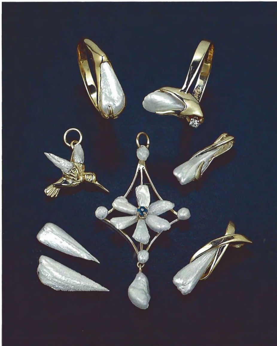
Figure 1. A sample of contemporary jewelry fashioned using American natural freshwater pearls. The pendant in the center is a reproduction of a piece from the Victorian era.

Besides buttons, numerous other mother-of-pearl products, such as handles for knives and razors, inlaid shell boxes, and other decorative objects, were turned out by these factories. By the turn of the century, Muscatine was the pearl-shell capital of the world. Button making brought prosperity to many areas, and steady employment to large numbers of factory hands as well as to the river folk and fishermen who gathered the mussel. The pearls were a valuable and important by-product, so pearl buyers from all over the world came to the button-making centers (Musgrove, 1962).