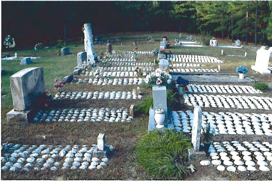
Figure 2. On "Decoration Day," the people who live and work along the Tennessee River gather at their family cemeteries and decorate the graves of their loved ones with freshwater mussel shells and other objects. The custom is said to have come to the U.S. from Ireland.

gained the heights they reached in the early part of the 20th century. The shell-button industry remained marginally active until the last major factory, located at Savannah, Tennessee, closed in the 1950s.