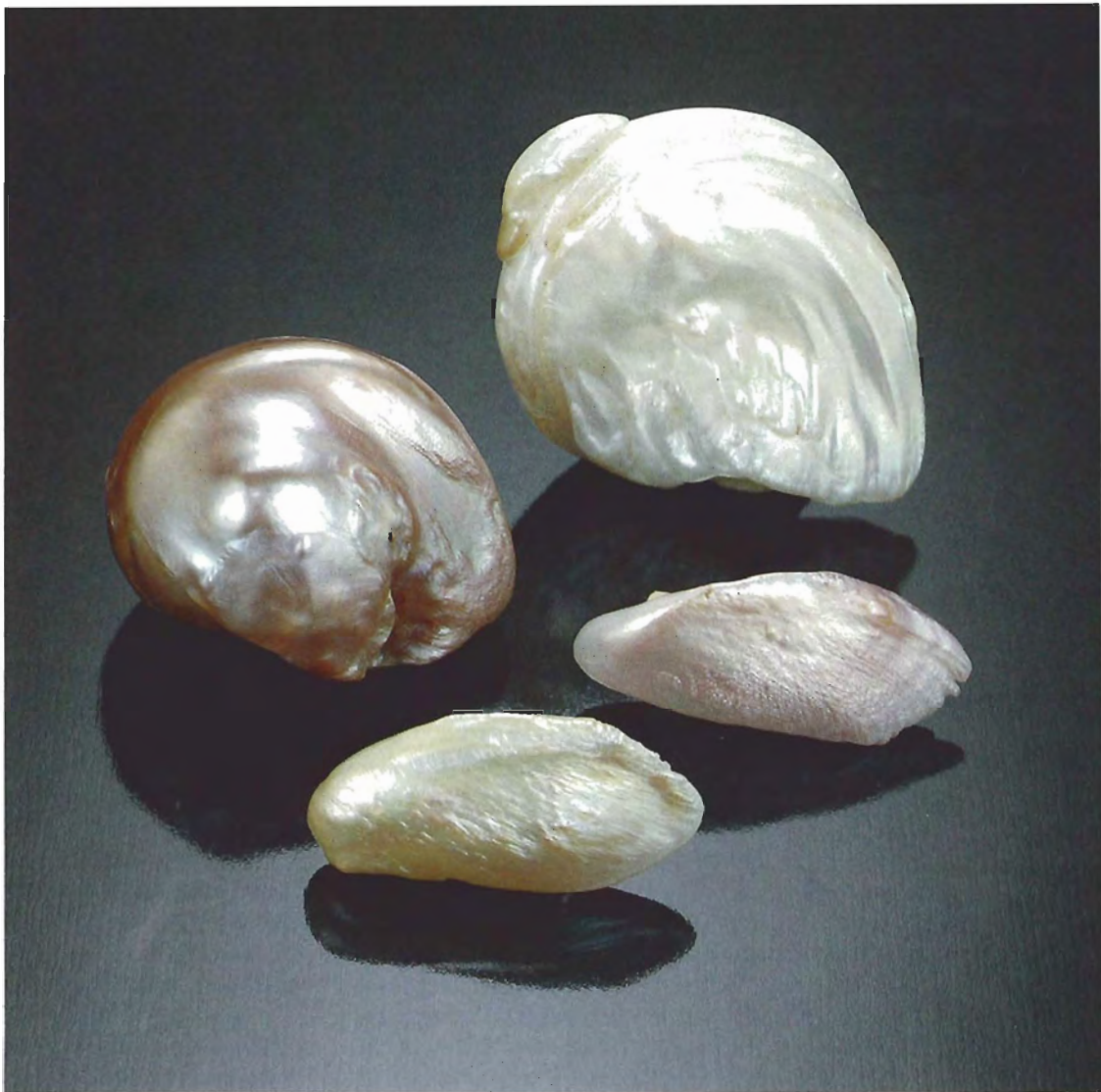
Figure 8. American natural freshwater pearls, nucleated by snails and periwinkles. Counter-clockwise, from top right: snail, white rosé, 39.0 × 30.0 mm (89.93 ct); snail, fancy bronze-lavender, 31.0 × 25.2 mm, (80.43 ct); pair of periwinkle pearls, matched, fancy pink and gold.

roundish outline. The top is always covered with bumps or ridges and, to be a true "rosebud," must be of very high luster and quality. Again, this type of pearl lends itself to fine jewelry. The bumpy or ridged surface is thought by the authors to be caused by multiple nucleation or by minute life forms or debris attaching to the surface of an otherwise smooth pearl. The face-up view of an exquisite and very large rosebud pearl is shown in figure 6, upper right.