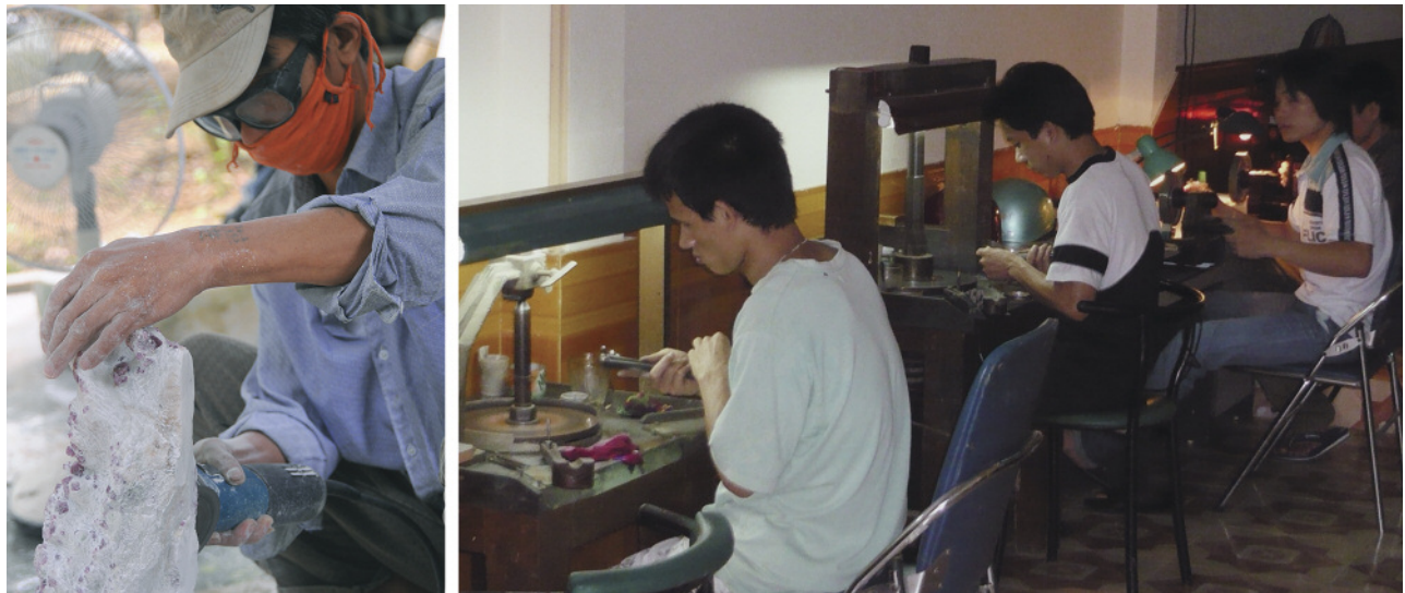
Figure 19. Left: A man trimming a block of red spinel in marble at his home. Right: A small cutting factory in Luc Yen.

feng shui stones. The original gem-bearing marble blocks are carved to reveal the gems and to produce artworks and artifacts (figure 19).