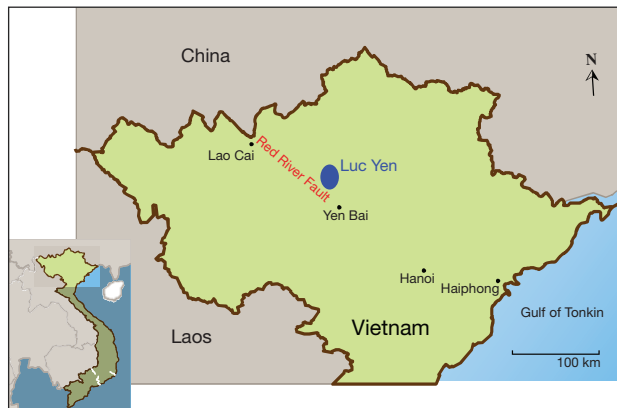
Figure 1. This map of northern Vietnam shows the location of the gem-rich Luc Yen district.

Marble-hosted ruby and spinel deposits represent the foremost source of colored gems in Central and Southeast Asia (Garnier et al., 2008). They are contained in a series of platform carbonates that underwent amphibolite facies metamorphism to form crystalline marbles during the Cenozoic continental collision between the Indian and Eurasian plates about 21–23 million years ago (Garnier et al., 2006). These deposits occur in Afghanistan, Pakistan, Azad Kashmir, Tajikistan, Nepal, Burma (Myanmar), China, and central and northern Vietnam (Hughes, 1997). In northern Vietnam, the deposits are located in the Yen Bai province (figure 1). The city of Yen Bai, the regional administrative capital, is located some 200 km northwest of Hanoi, about halfway to the Chinese border. It was an important local gem trading center during the 1990s (Kane et al., 1991; Kammerling et al., 1994), though most of the dealers have since relocated to Hanoi. Luc Yen, on the other hand, is a mountainous district located in the north of Yen Bai province. Its main city, Yen The, is also known as Luc Yen, the name given to the ruby and spinel mining district described in the gemological literature (e.g., Kane et al., 1991; Pham et al., 2004a).