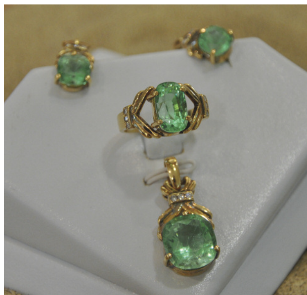
Figure 8. These faceted gem-quality green feldspars, weighing between one and three carats, are from Luc Yen.

in paddy fields has restricted mining. This feldspar ranges from light to dark green, and from opaque to transparent. Most of the production has only been suitable for cabochon cutting. The stones are typically traded as amazonite, a variety of microcline feldspar, which is found in rare-element pegmatites (Nguyen, 2010). It is associated with smoky quartz, albite