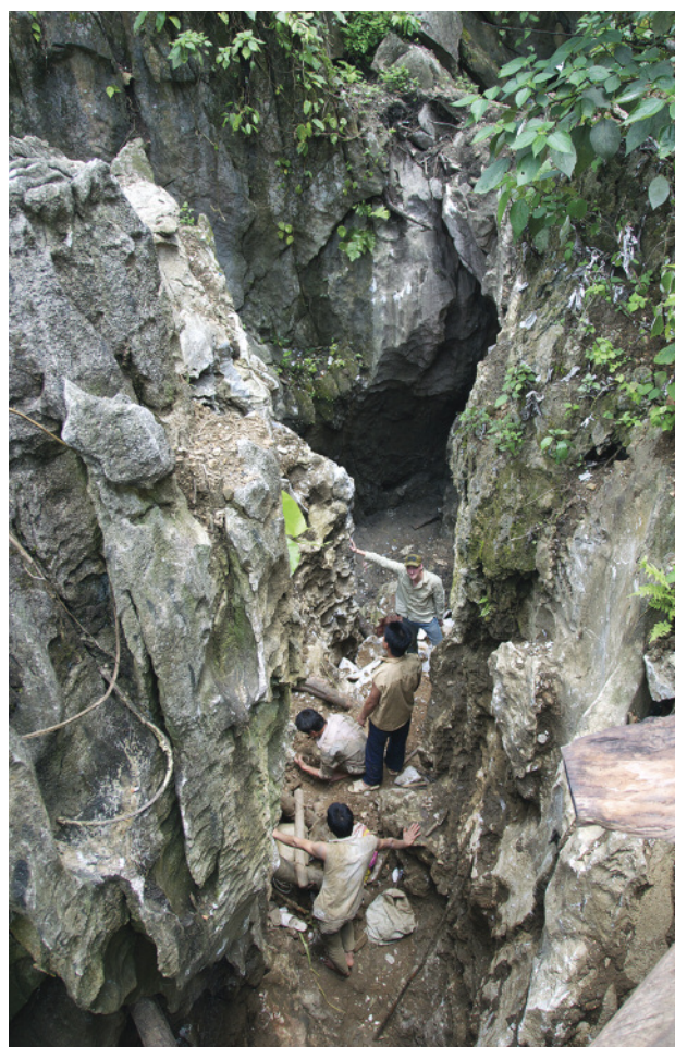
Figure 16. A team of miners works a deep and wide crevasse in the karsts at Bai Son in search of beautiful light blue spinel.

Tourmaline. Compared to corundum and spinel, mining activities for tourmaline in Luc Yen are less intensive. Tourmaline is often extracted by locals along the streams in Minh Tien and Nuoc Ngap (An Phu municipality).