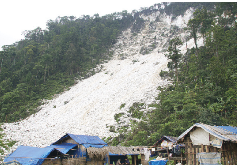
Figure 13. A view of the Cong Troi marble cliff, the largest pink spinel mining area in the Luc Yen region, with the mining camp in the foreground.

censes were allocated to some Indian companies for extracting white marble intended for export. When geological drilling operations began in the area, local miners had to stop mining. Once drilling was completed in late 2010, work resumed. In 2012, approximately 20 miners were at Cong Troi (figure 13), most of them between 17 and 35 years old.