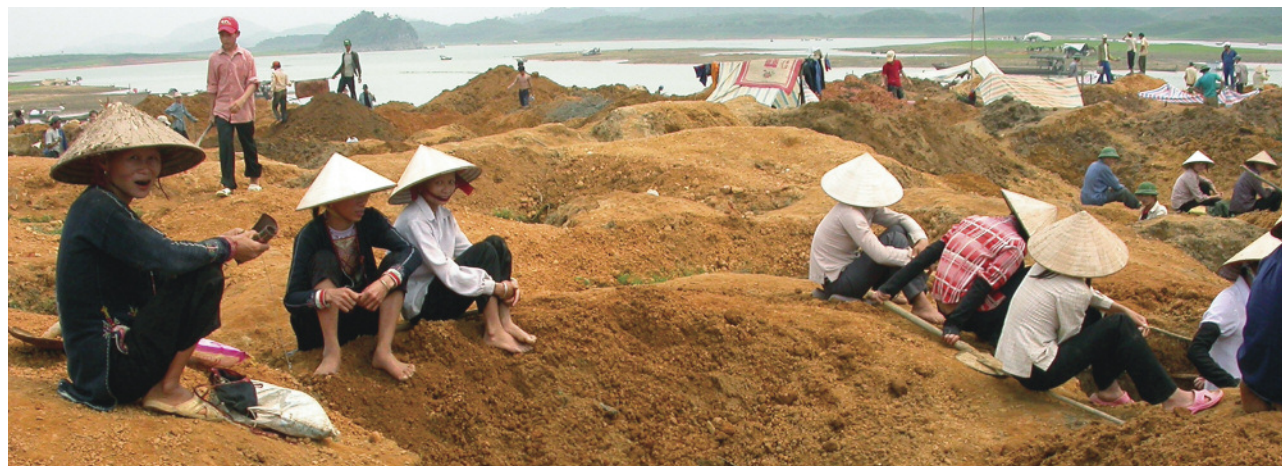
Figure 3. Local miners take advantage of the low water level at Thac Ba Lake to dig for rubies during the spring of 2005.

ket. In 1995, the mines went under the management of the Vietnam National Gems and Gold Corporation (VIGEGO). A 2003 merger formed the Vietnam Minerals Corporation (VIMICO), and the Luc Yen mines are no longer controlled by the state. Local