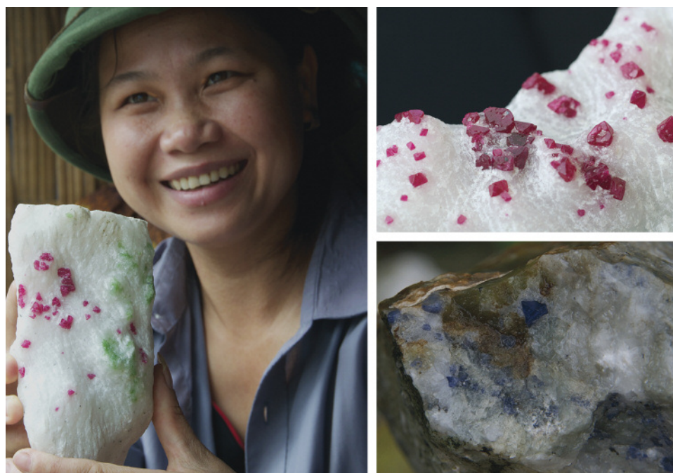
Figure 14. Left: A miner shows the association of spinel and pargasite in marble. Right: Red (top) and blue (bottom) spinel in marble.

Secondary Deposits (Placers). Ruby, Sapphire, and Spinel. Corundum and spinel are mingled in alluvial placers. Mining is conducted on a small scale, from Bai Lai in the northeast of Luc Yen to the Na Ha area in the south, near the banks of Thac Ba Lake. The most active sites are along the streams of Cong Troi, in Nuoc Ngap (An Phu area). Material is also removed from old mines in areas such as Minh Tien, Khoan Thong, and Bai Chuoi (figure 15), where big companies mined the most accessible and profitable material, often missing areas between marble pinnacles that excavators could not easily reach. As a result, some gem-rich ground was left behind; this is now collected by locals with shovels and buckets. In