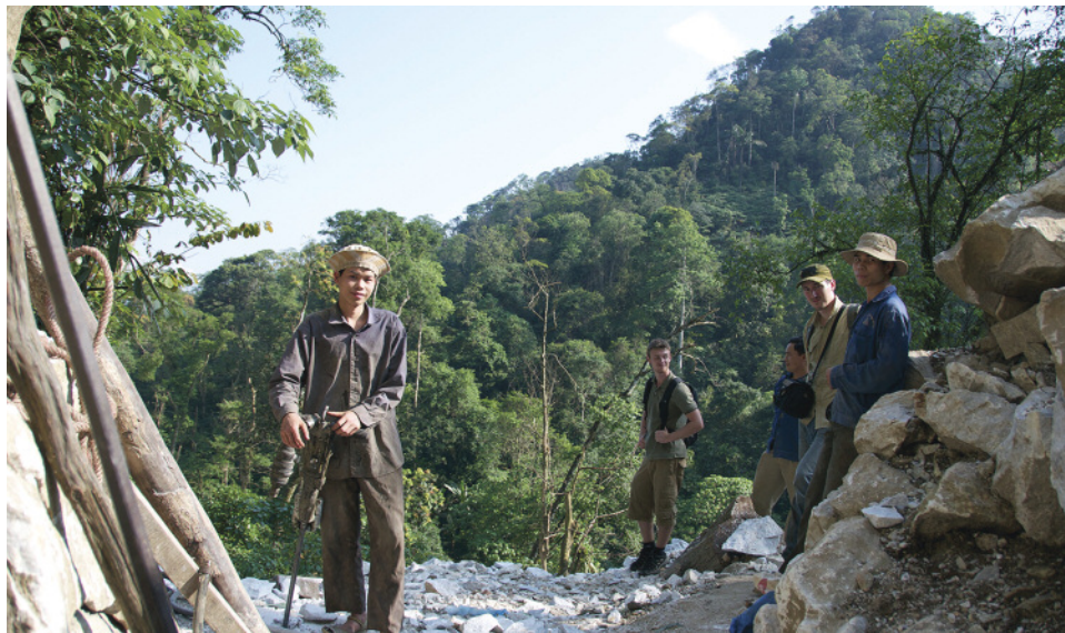
Figure 10. A young miner stands with his jackhammer in front of a ruby mine at May Thuong.

In 2010, ruby was discovered in the marble at Bai Gau (Bear Site), near the Bai Chuoi (Banana Site) area. These ruby crystals, associated with pargasite, have a fine color.