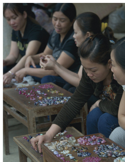
Figure 17. Though only a fraction of its size during the 1990s, the Luc Yen gemstone market is still held daily.

low transparency, making them suitable only for cabochon cutting or as collection samples. Local farmers are officially forbidden to mine there, but some still occasionally find pockets of rubellite weighing tens of kilograms.