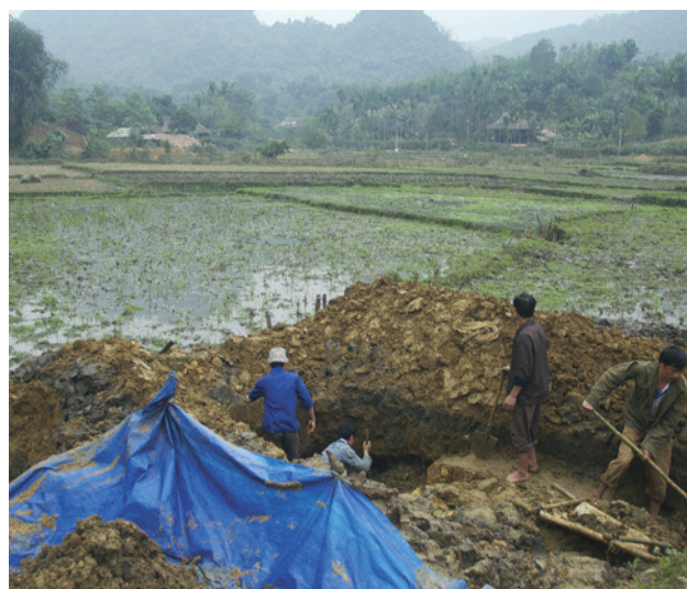
Figure 15. Farmers dig for gems in the paddy fields near Minh Tien. Photo by Vincent Pardieu, © GIA.

Spinel from An Phu and the surrounding area have typical features. Their color can be red, brownish red, reddish brown, purple, pink, purplish pink, blue, or sky blue. The pink to red spinel can be found throughout the area, but blue specimens are recovered mainly from Co Ngan, Khau Ca, and Kim Cang. The sky-blue spinels are mostly found in colluvial material from crevasses in the Bai Son and Lung Thin areas, where miners follow the caves underground to a 5–8 m depth (figure 16).