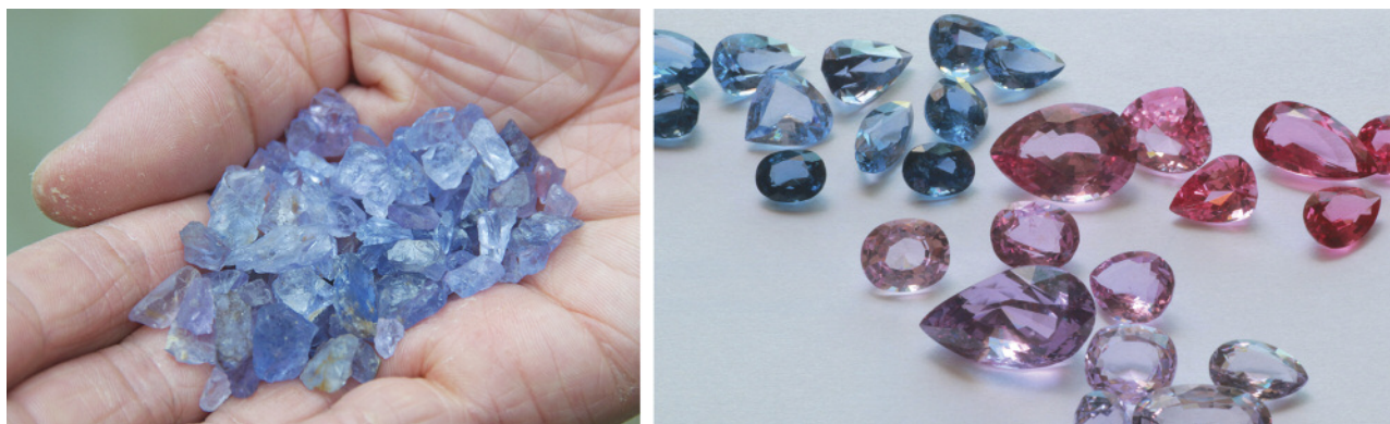
Figure 6. The rough sky-blue spinel on the left is from the Bai Son mine. The cut spinels from Luc Yen (right) weigh 2.3 to 11.9 ct.

Spinel Deposits. Gem spinel, hosted in either marble or placers, was discovered in Luc Yen in 1987, together with ruby and sapphire. Local farmers mine gem-quality spinel from placers along the streams and from alluvial deposits. The specimens exhibit red, brownish red, pink, purple, sea-blue, and sky-blue colors (figure 6). Faceted spinels of up to several hundred carats are known, but most of the faceted gems weigh less than 10 carats. The red, brownish red, and pink spinels are found in An Phu, Minh Tien, Bai Gau, and Khoan Thong. Cong Troi is the source of pink and purple spinels, while dark sea-blue specimens are mined mostly in Co Ngan and Bai Gau. Fine “electric” blue spinel crystals (usually small and/or included and under three grams) come from Khe Khi, Ba Linh Mot, and Khau Ca. Sky-blue material is produced in the Bai Son and Lung Thin areas, as well as near Bai Gau (Senoble, 2010).