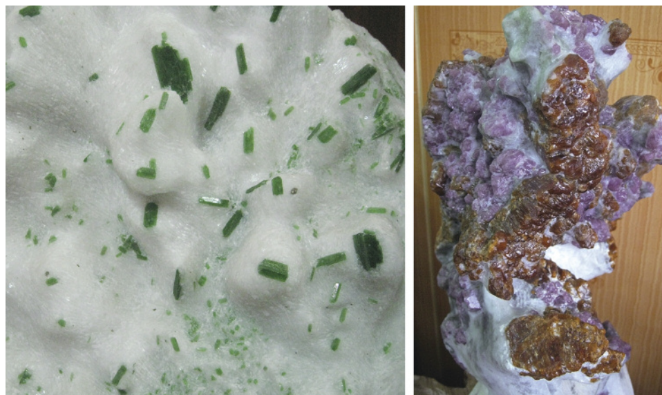
Figure 9. Pargasite (left) and humite crystals (right) occur in marble at Luc Yen.

(cleavelandite), tourmaline (elbaite), and Li-mica (lepidolite). Facet-grade transparent green feldspar (figure 8), which is very rare here, has been identified as green orthoclase (Laurs et al., 2005).