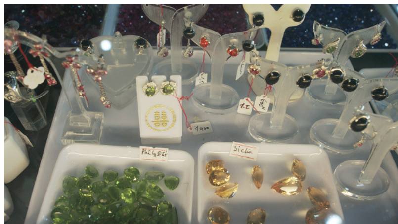
Figure 18. Common misspellings in the Luc Yen gem market include “rubi,” “sapier” for sapphire, “sitilen” for spinel, “phelydot” for peridot, and “siclin” for citrine.

In Luc Yen, most of the dealers are also skilled cutters, with one or two cutting machines at home. Nevertheless, some local family businesses have evolved into small factories equipped with a few machines, cutting gems directly for customers. A number of old cutting factories have switched to carving