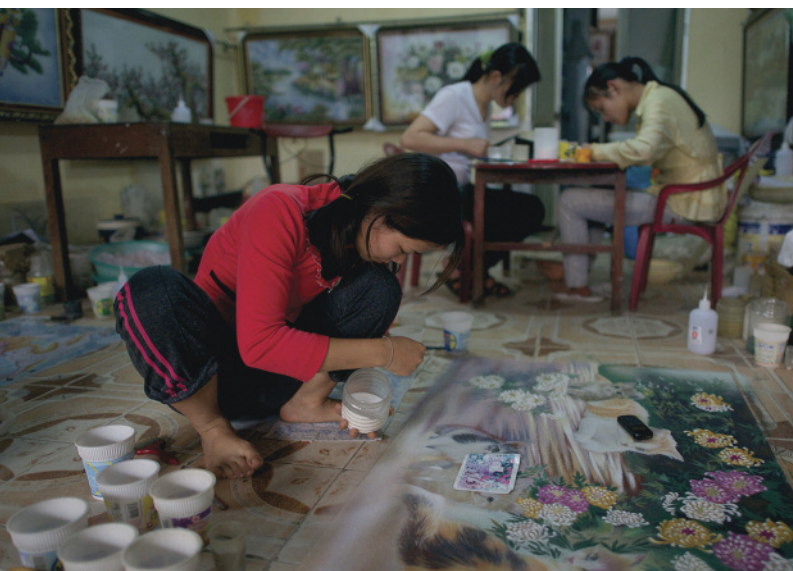
Figure 20. Gemstone paintings are produced and sold in Luc Yen.

works (figure 20). Gem grains may be polished for higher-quality paintings.