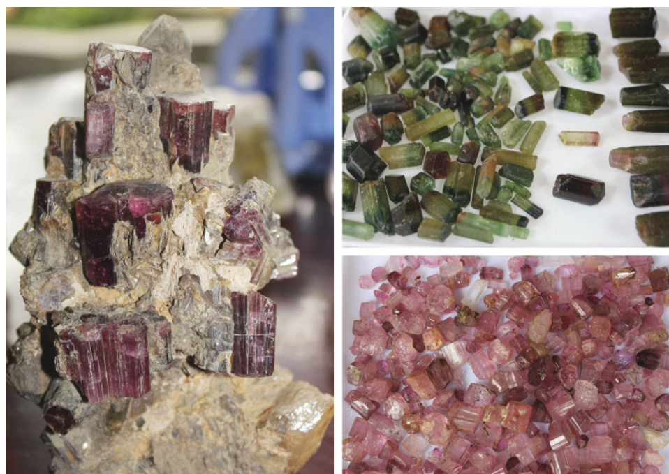
Figure 7. The rubellite crystals are from Tan Lap (left) and Khai Trung (bottom right); the green tourmalines are from An Phu (top right).

In Luc Yen, rough spinel crystals occur in dolomitic marble with calcite, phlogopite, humite, and pargasite. Formation takes place in metasomatic zones resulting from the percolation of fluids in the marble. The crystals, which range in size from a few millimeters to five centimeters, are of octahedral habit and have a red to brownish red color. Spinel crystals in placers are more transparent and are used for gem cutting. Larger crystals in host rock are usually translucent to opaque, and suitable only as collection samples.