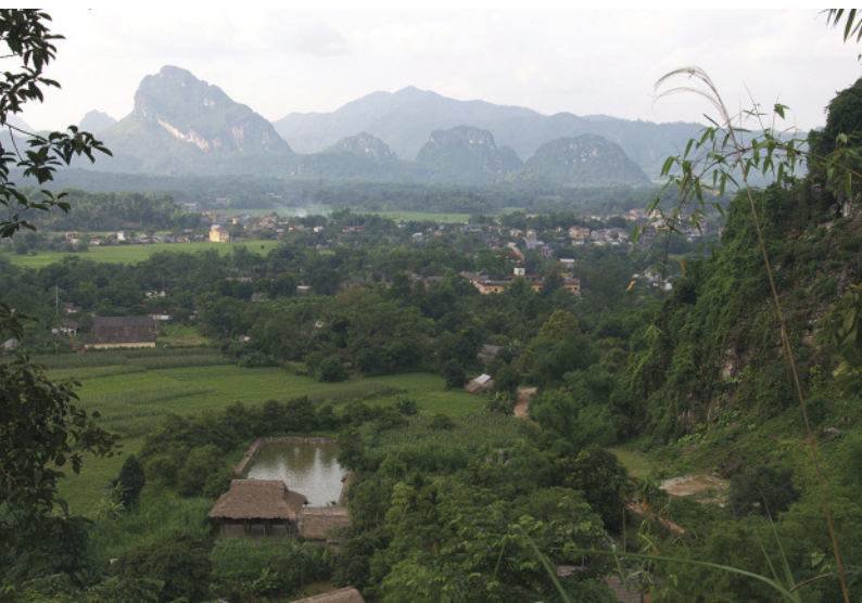
Figure 2. A view over Yen The, the quiet capital of Luc Yen district. The town is surrounded by paddy fields and jungle-covered, karst-type mountains.

ated in 1970 by the construction of a dam for Vietnam's first hydroelectric power plant. Thac Ba Lake is 80 km long, with a maximum width of 10 km, and contains more than a thousand islands. Covering the expanse between Tan Huong and the Luc Yen peninsula, it has submerged a potentially gem-rich area.