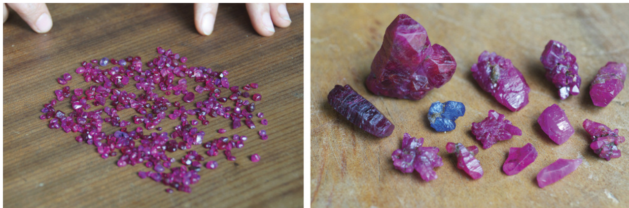
Figure 5. Rough ruby and sapphire crystals from An Phu (left) and small rounded rubies hosted in placers (right) are sold in the Luc Yen gem market.

phlogopite (An Phu); and (c) fissures with graphite, pyrite, phlogopite, and margarite (Bai Da Lan mine and Minh Tien).