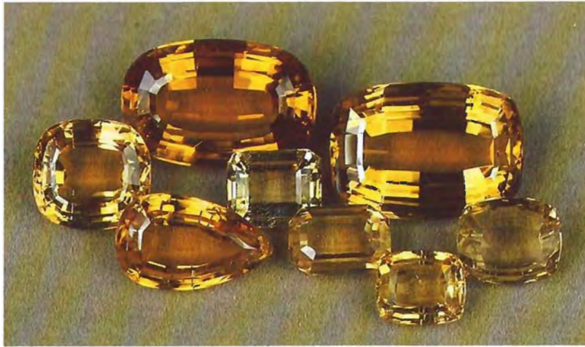
Figure 1. Samples of radioactive neutron-irradiated spodumene. The large orange stone at the top (31.8 ct) was emitting about 249,000 gamma rays per minute at the time of the photograph. The greenish-yellow emerald-cut stone directly below and to the right (5.97 ct) emitted 870,000 gamma rays per minute. The third stone discussed in this article, a 2.90-ct orange-yellow emerald-cut spodumene, is directly below and to the right of the greenish-yellow stone studied.

ganese-54 (half-life: 303 days) and tin-113 (half-life: 115 days) were also observed. The activity from the smaller, orange-yellow spodumene came, in decreasing order, from manganese-54, tin-113, zinc-65 (244 days), iron-59 (45 days), antimony-125 (2.8 years), antimony-124 (60 days), and cobalt-60 (5.2 years). The large, orange spodumene contained manganese-54, tin-113, zinc-65, antimony-125, iron-59, and tantalum-182 (115 days). All of these isotopes emit energetic, penetrating gamma rays.